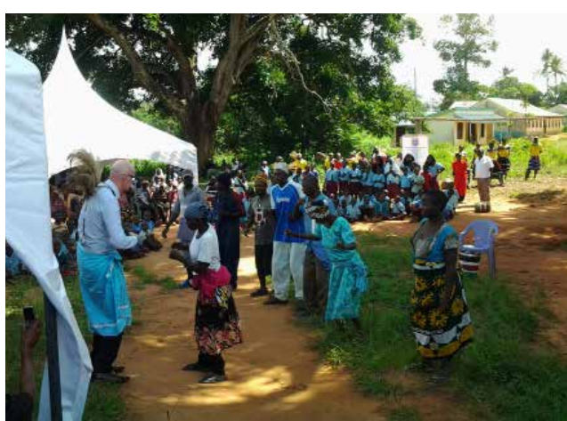
The Belgium Ambassador in a jig with Kwale residents