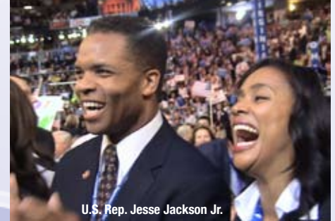
U.S. Rep. Jesse Jackson Jr.

"Sen. Burris, by deliberately lying to senators about the conversations he had with Gov. Blagojevich and others connected to the governor in order to be appointed to a seat in the Senate, clearly engaged in improper conduct reflecting upon the Senate," a potential violation of the Senate