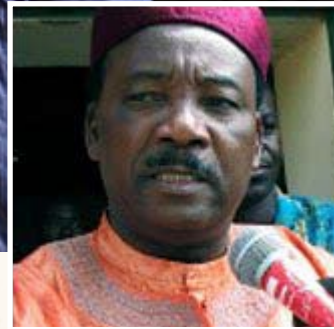
Mr. Mahamadou Issoufou