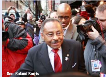
Sen. Roland Burris