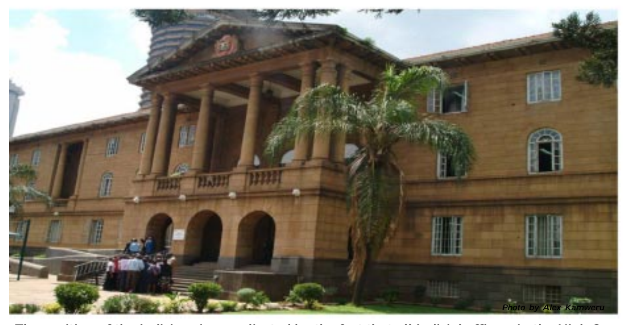
The position of the judiciary is complicated by the fact that all judicial officers in the High Court and the Court of Appeal who hear Election Petitions are, under the Constitution of Kenya, appointees of the President.